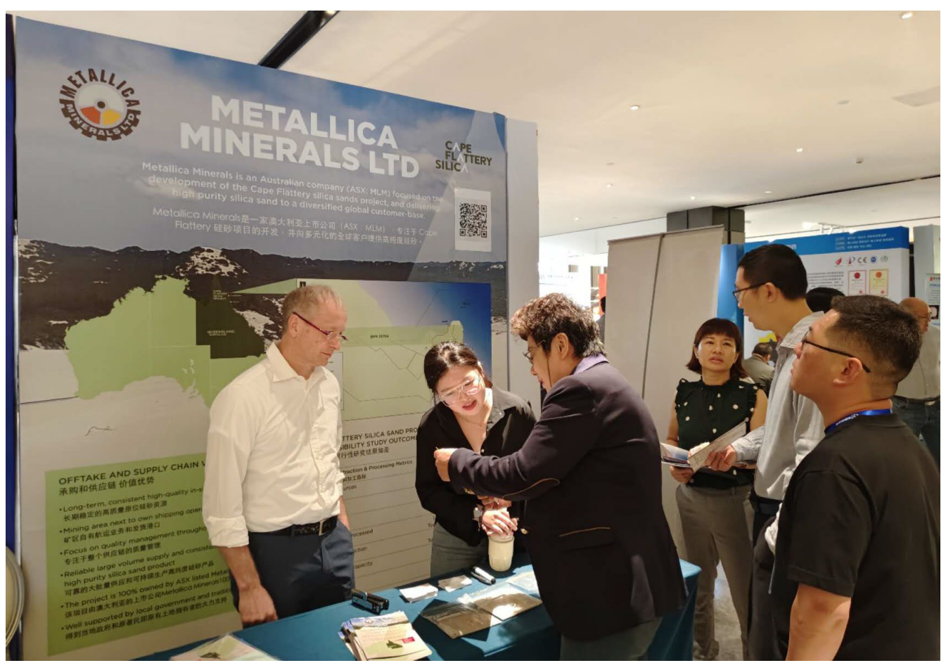
Figure 1: Metallica Minerals booth at the PV Glass Manufacturing conference in Anhui Province

Later in May, CFS will be hosting a site visit to Cape Flattery with a potential offtake partner. This is the next step in their evaluation of the project following meetings held during the March 2023 international roadshow.