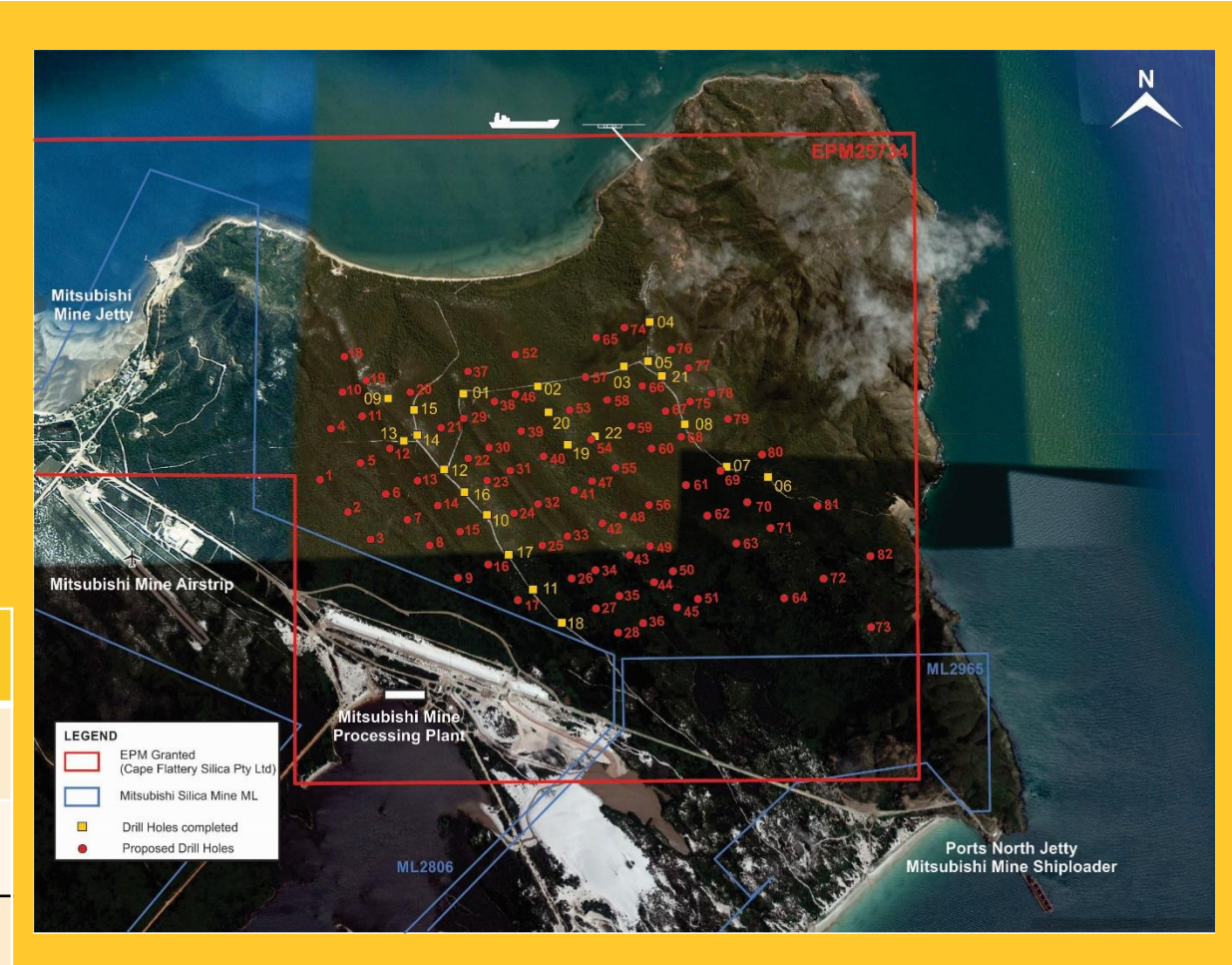
CFS Project – Eastern Resource Area – planned Drill holes June 2021