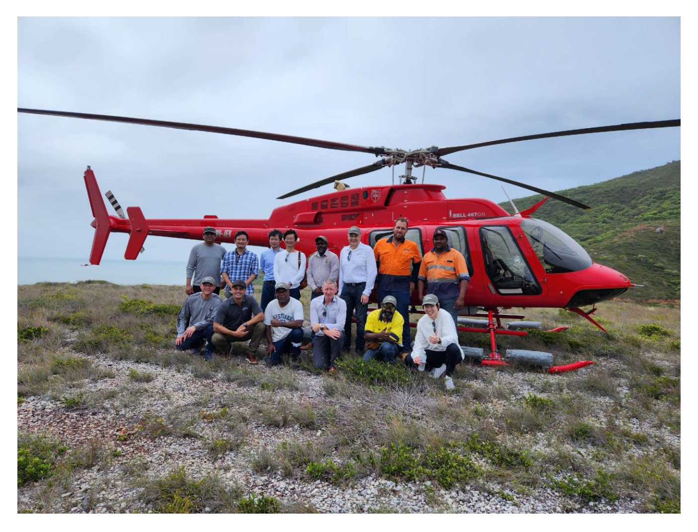
Figure 1: Mitsui team at Cape Flattery with CFS management and Dingaal and Nguurruumungu representatives