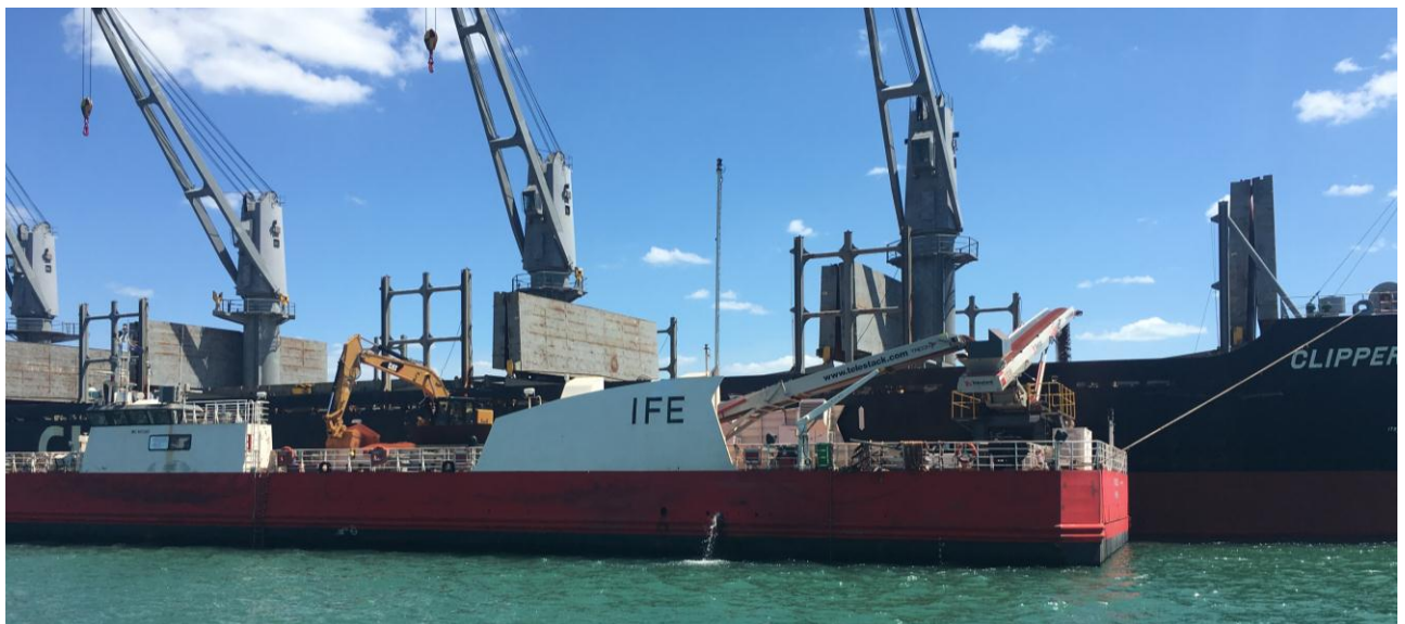
Figure 1: MV Ironclad I transshipping bauxite to an ocean going export vessel

The Cape York HMS & Bauxite Project Joint Venture (Joint Venture), in which Metallica's wholly-owned subsidiary, Oresome Australia Pty Ltd has a 50% interest and is the manager of the joint venture, had previously entered into a Heads of Agreement with GCR for direct shipping bauxite (DSB) from the Joint Venture's Urquhart Bauxite Project (see ASX release 7 April 2016 ), located 15km away from Hey Point. Metallica provided working capital to GCR via a Short Term Loan (Loan) (see ASX release 4 October 2016 ) to assist that company's successful maiden bauxite export from the Hey Point facility. Under the terms of the loan, GCR is now bound to provide transshipping services and access to Metallica.